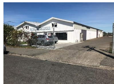
1022 Manchester St, Hastings