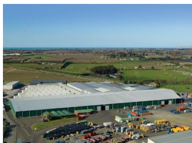
Watties Distrib. Ctr, Hastings | Photo Erskin & Owen

Contact Team Turley www.turley.co.nz/tcl-people/our-people for comprehensive commercial-industrial property information and metrics (rents, yields, land values transactions, etc). And developments tracking 2015-20. Refer overleaf.