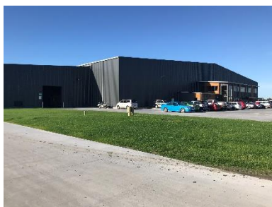
Sunfruit, Hastings