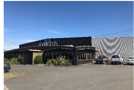
The Milk Kitchen, Whakatu