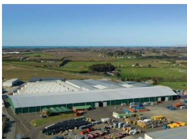
Watties Distrib. Ctr, Hastings

Turley & Co's Macro report lists Hawke's Bay industrial developments www.turley.co.nz/news-2/current .