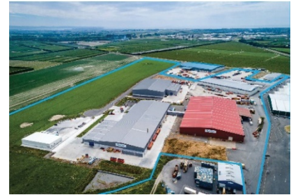
Tomoana Food Hub, Hastings

Refer to coinciding Turley & Co Macro, Retail and Office reports www.turley.co.nz/news-2/current . And economic indicators www.turley.co.nz/indicators