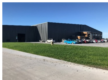
Sunfruit, Hastings