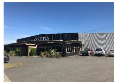
The Milk Kitchen, Whakatu