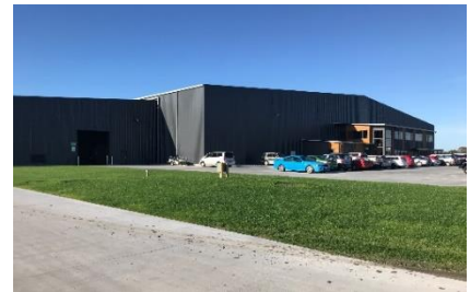
Sunfruit Irongate Hastings

Refer to Full Report for vacancy and inducements. Refer to Turley & Co for TOC definition and exclusions.