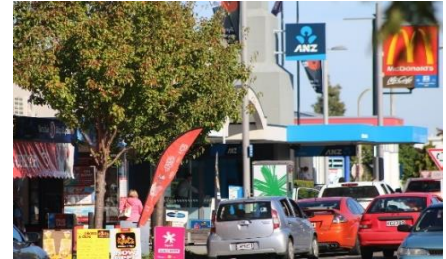
Taradale Mainstreet

Refer to Full Report for vacancy and inducements. Refer to Turley & Co for TOC definition and exclusions.